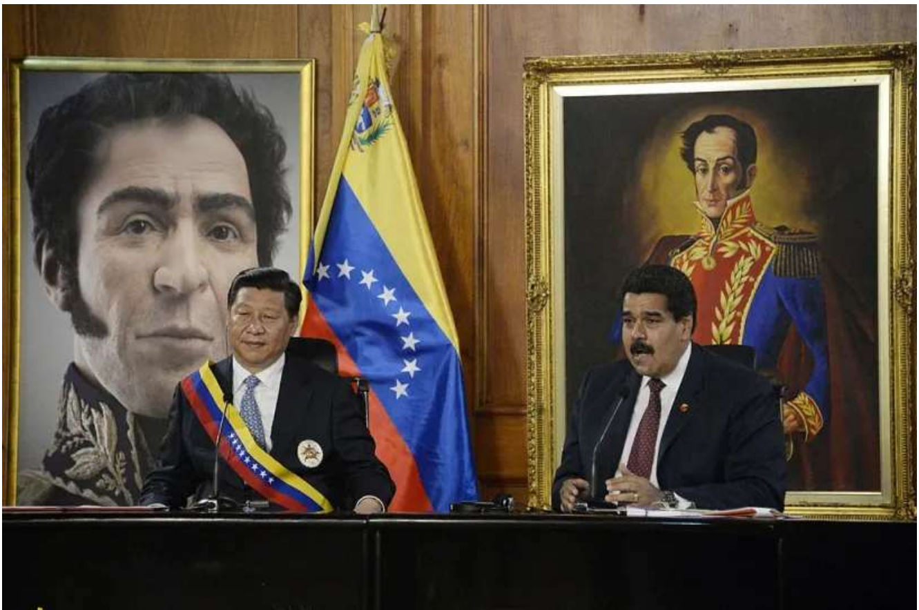
Venezuelan President Nicolas Maduro speaks next to China's President Xi Jinping at the Miraflores Presidential Palace in Caracas on July 20, 2014.